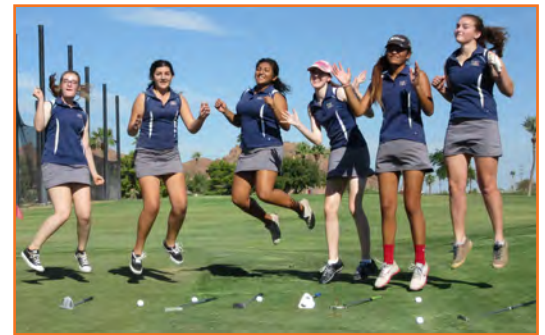
McClintock High School Girls Golf Team

AWGA's Build a Team program has just finished its fourth season helping Arizona high school girls' golf teams. To date, thirteen teams have benefitted by receiving uniforms, equipment and professional lessons that otherwise would not have been available to them. We have received 19 applicants from Yuma, Tucson and the Phoenix metro area vying for the limited funding available to help schools in 2016. Coaches and schools have seen the benefits of the lessons when they have a match against a Build a Team school. The program continues to improve as more teaching professionals are interested in being a part of the program and are willing to significantly reduce their regular fees or donate their time for lessons. Lessons are provided throughout the summer so that the teams are ready for the start of the season in late August. Leagues and clubs at local golf courses are stepping up and "adopting" teams by donating funds to the schools. This provides a sustainable source of income for the girls' golf teams and allows the limited AWGA funds to be given to another school in need.