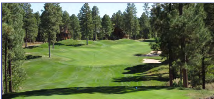
Flagstaff Ranch Golf Course

The 2015 series of Just 4 Fun Days ended on a glorious fall day in Show Low on the Tower Course at Torreon. People are finally getting used to the fact that guests are welcome, we don't keep score, and laughter is supposed to happen on the golf course. It echoed through the trees all afternoon.