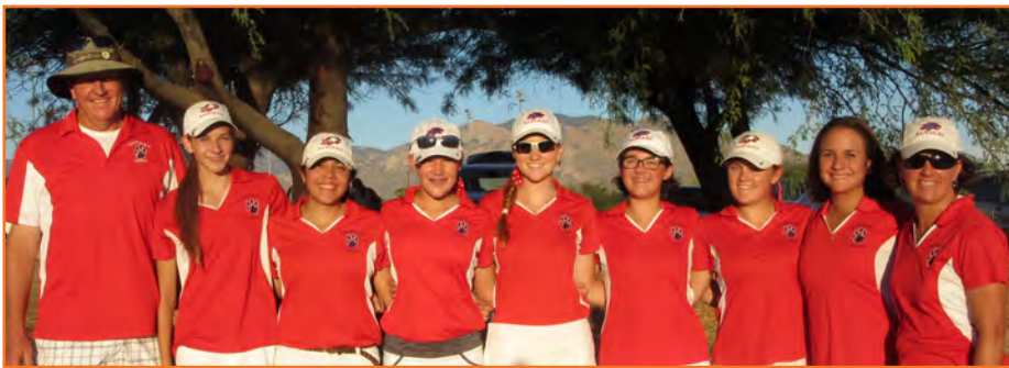
Saguario High School ~ State Champions